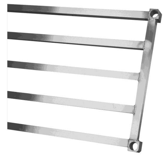
H.D. Style Shelf

These shelves carry a Lifetime Guarantee against rust and corrosion and also carry a One- Year Guarantee against workmanship and material defects.