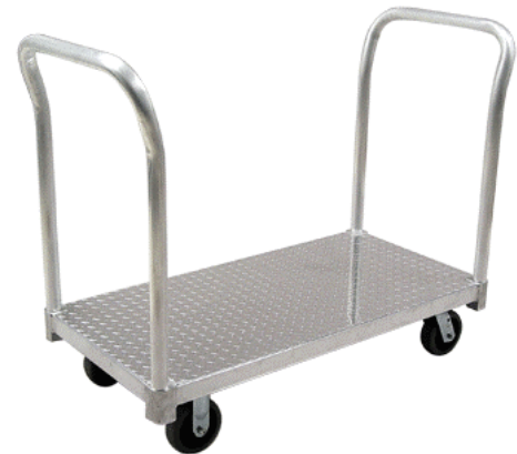
Tread Plate Deck