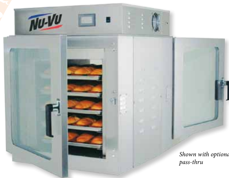
Shown with optional pass-thru

The RA-5T Tabletop Oven features our exclusive Moving Air system. Heat is distributed evenly throughout the oven cavity by the fan located in the top of the oven which blows the air down the inside walls of the cavity and up and out through the holes at each shelf. This gives your product an even bake, top to bottom, side to side, and front to back and requires less energy per pan. The three speed fan allows baking and cooking all types of products. The standard RA-5T offers you precise baking and cooking of 5 full size sheet pans with generous 4" spacing. If you produce taller product, you can specify 4 shelves at 5" spacing. The RA-5T is constructed of stainless steel. User friendly programmable controls provide cooking parameters with just the touch of a button. The slam-cam handle and cool-to-touch dual pane door provide safe and easy usage. A pass-thru option is available, and allows back of the house loading, with front of the house unloading. Being just 30" wide and the ability to be stacked, it is the perfect convection oven to add where space may be limited.