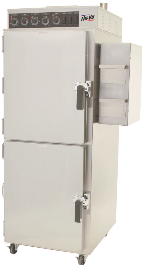
Shown with optional external smoke box