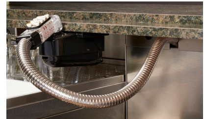
Note: Sode gun system not included. Shown for clarity only.