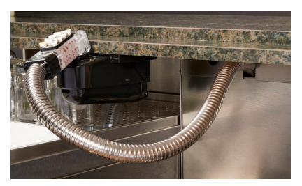
Note: Sode gun system not included. Shown for clarity only.