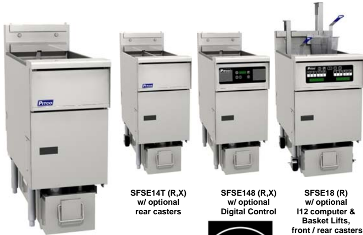
SFSE14 (R,X) w/ standard SSTC