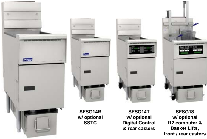
SFSG14 w/ standard Millivolt T-Stat

SOLOFILTER Solstice Gas (SFSG) Series SFSG14, 14R, 14T, 18 Fryer