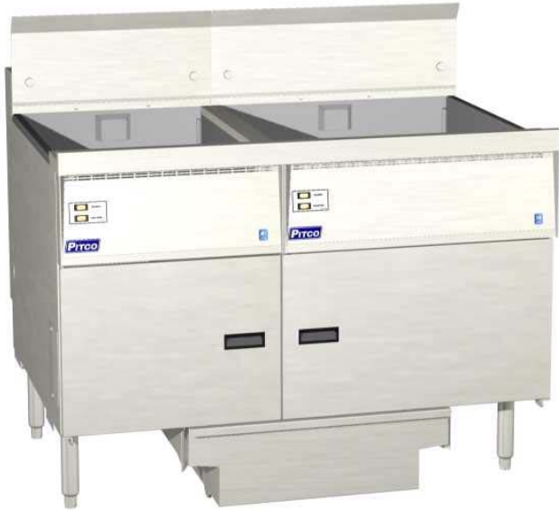
Unit shown is FBG18/FD/FBG24