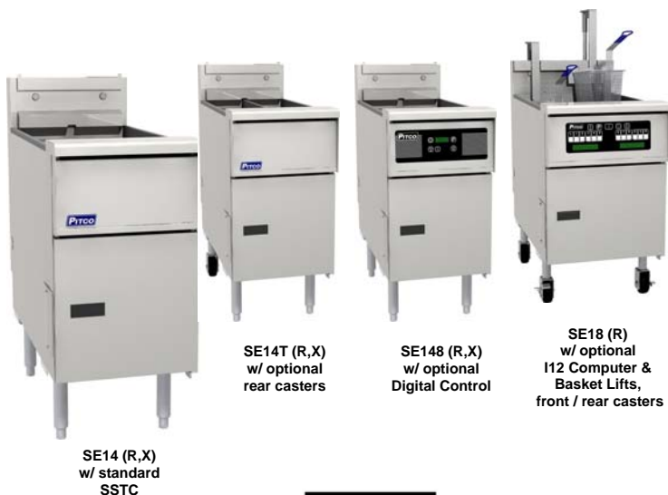
SE14 (R,X) w/ standard SSTC