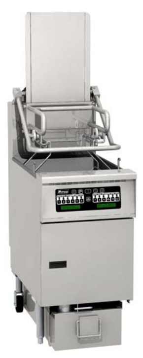
SFSG6H w/ profile computer, optional 10" rear rigid casters