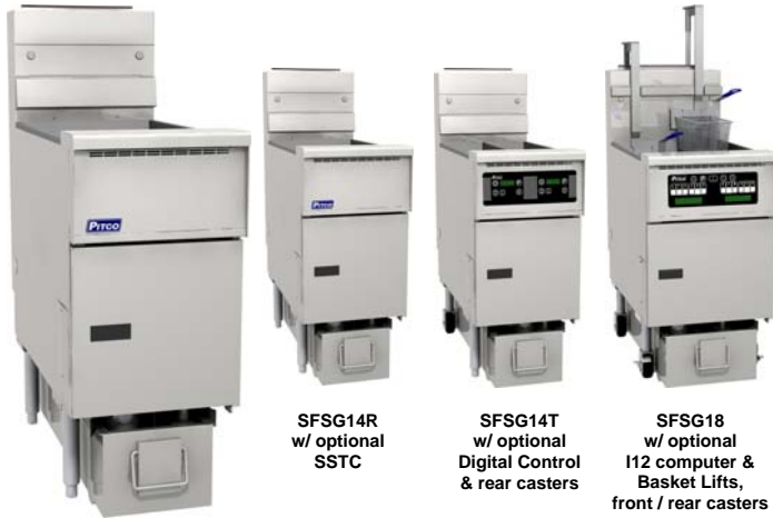
SFSG14 w/ standard Millivolt T-Stat

SOLOFILTER Solstice Gas (SFSG) Series SFSG14, 14R, 14T, 18 Fryer