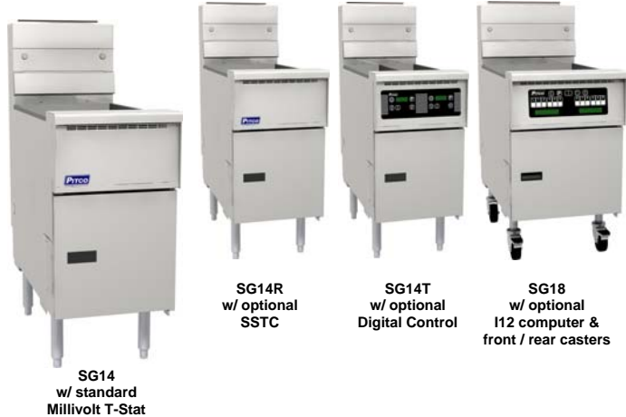
SG14 w/ standard Millivolt T-Stat

For High Production Gas frying specify Pitco Solstice Gas Models SG14, 14R, 14T or SG18 tube fryers with the patented Solstice Burner Technology. The dependable blower free atmospheric heating system provides fast recovery to cook a variety of food products. The Solstice gas fryer comes standard with a millivolt thermostat, for melt cycle and boil mode choose the optional quick responding solid state thermostat with the matchless ignition system. The optional digital control and the elastic time computer are available and can be used with our optional labor saving highly reliable basket lift system. The patented self cleaning burner and down draft protection keeps your fryer tuned up for peak daily performance.