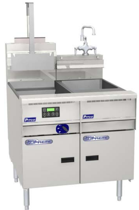
Model SSPG14/SSRS14 Shown with option: Single Basket Lift

Model SSPG14, SSRS14 Solstice Supreme Pasta Gas Cooker and Rinse