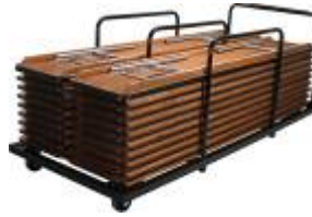
Transport Cart Model # HD-APTC96