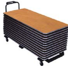
Transport Cart Model # HD-BTC96