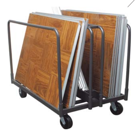
Custom cart for convienent transport - holds up to 24 panels and trim pieces.

Now engineered to FIT PERFECTLY with other leading