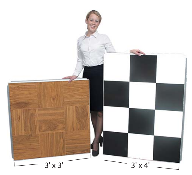
Choose between 3' x 3' and 3' x 4' panel sizes in classic Wood Grain or contemporary Black & White.

Drop Protection. Exclusive corner reinforcement minimizes drop damage!