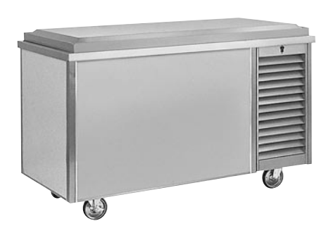
model 14G FTA-3S Open Base shown