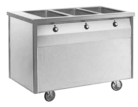
model 14G HTD-3S Storage Base shown