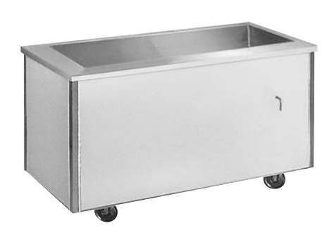
model 14G IC-3S Open Base shown