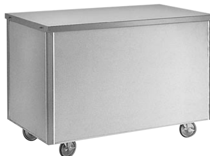
model 14G ST-4S Open Base shown