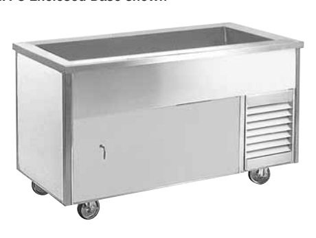
model RAN SCA-3S Open Base shown