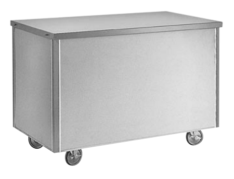
model RAN ST-4S Open Base shown