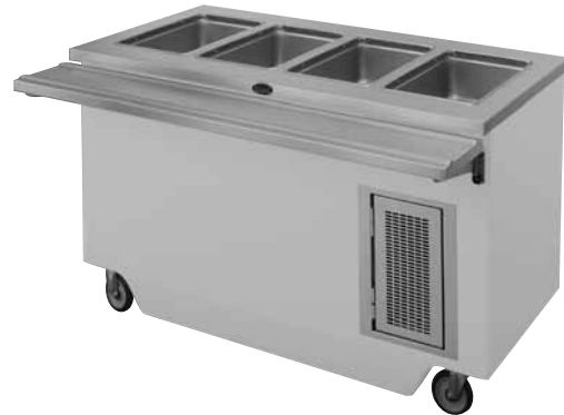
model RANFG HTD-4S shown with optional kick plate