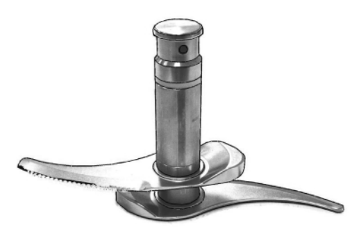
Two Blade Assembly