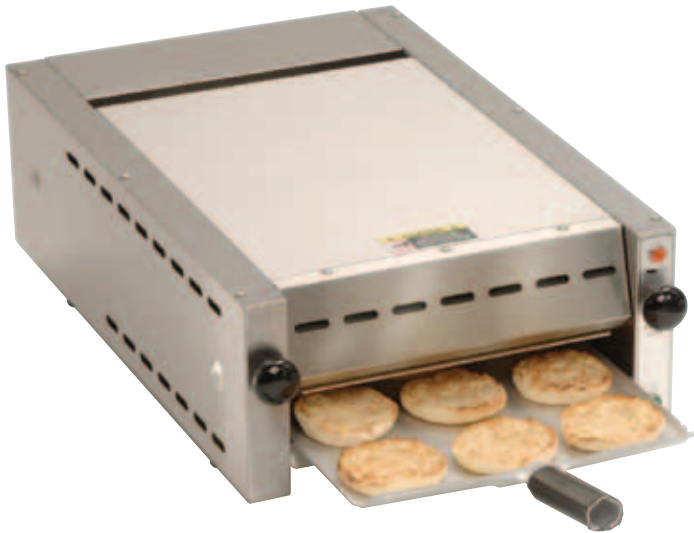
MT-12 includes spatula

Complete any breakfast sandwich by serving it on a toasted English muffin. The Muffin Toaster can perfectly toast up to 12 muffin halves in only 90 seconds, making it easy to keep up with the growing demands of the breakfast daypart.