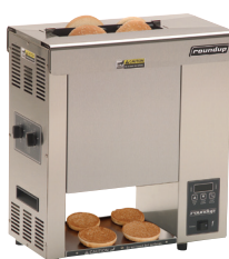
with heated base

Bring out all of a burger's flavors by serving it on perfectly toasted buns. The Vertical Contact Toaster gives buns a consistent, golden brown finish so they won't soak up the juices of the ingredients and the burger will stay firm and taste delicious.