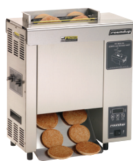
with wide mouth bun feeder