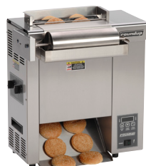
with mechanical butter wheel and bun feeder