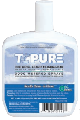
Pump Refill 401192