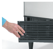
Front Air Filter