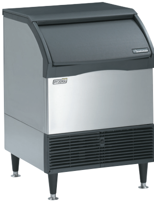
CU1526 / CU2026