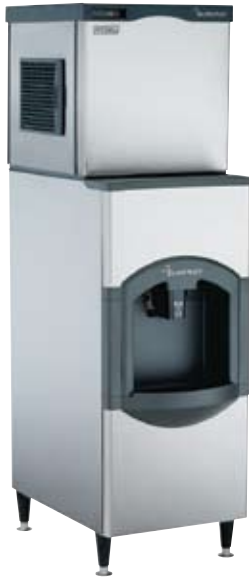
HD22 shown with a Prodigy C0322A cuber