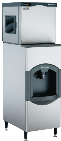
HD22 shown with a Prodigy C0322A cuber