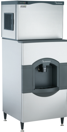
HD30 shown with a Prodigy C0330A cuber