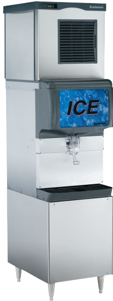
Shown on ID150 dispenser.