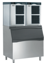
N0922 shown side by side on B948S bin