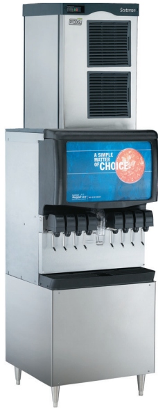
Shown on beverage dispenser.