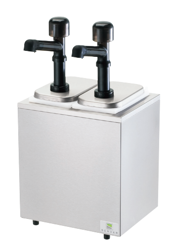
ò ò ••• SR-2 79850