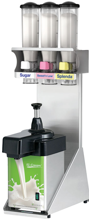
BEVERAGE STATION 24 OZ BS-ST 80105