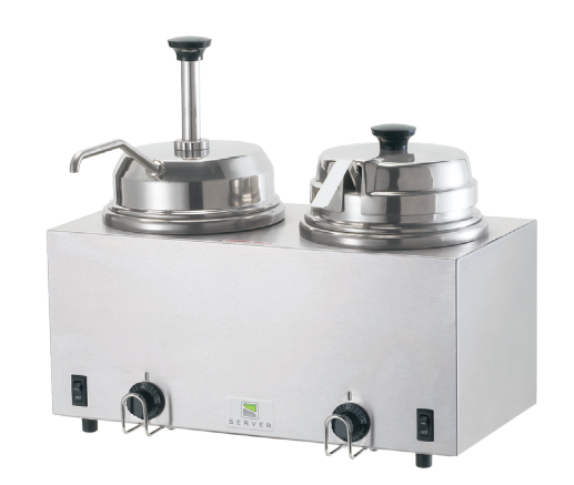
TWIN FS/FSP 81290