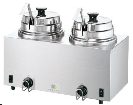
R r TWIN FS 81220