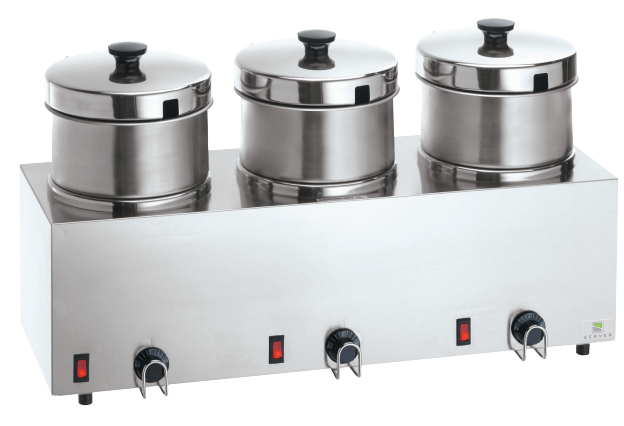
R TRIPLE FS-4+ 85900