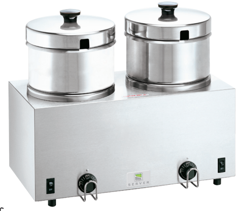
TWIN FS-4+ 81200 ALSO AVAILABLE FOR EXPORT