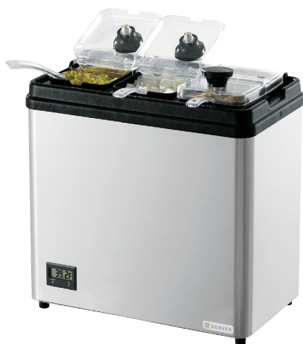
CC-1/3 NL COMBO 86006**

* SHOWN WITH (3) 1/9-SIZE JARS (87203), NOT INCLUDED