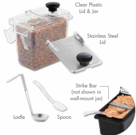
Clear Plastic Lid & Jar

* Note: Jar rests ergonomically at 20° angle; capacity is affected slightly.