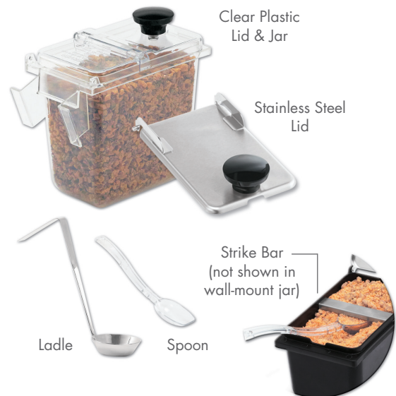
Strike Bar (not shown in wall-mount jar)