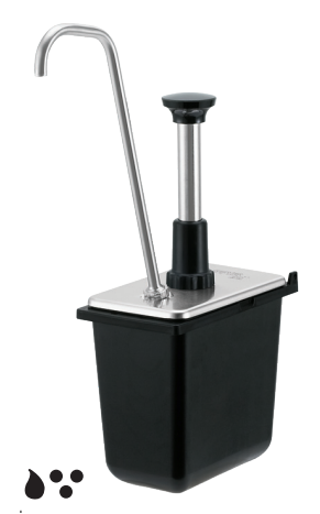
CP-1/9 TALL 87249