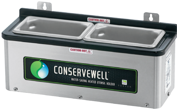
CW 87740 - CONSERVEWELL™ SERVICE UTENSIL HOLDER