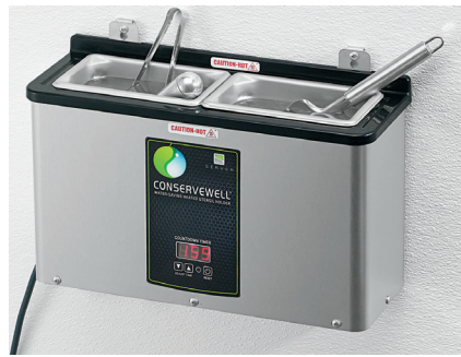
CONSERVEWELL™ Model CW