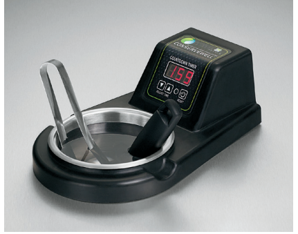
CONSERVEWELL™ Model CW-DI