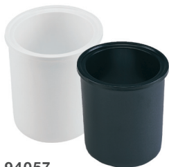
94057 HOLDCOLD™ JARS