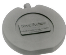
94013 EUTECTIC ICE PACK