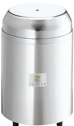
ECH 94090 (NSF LISTED)