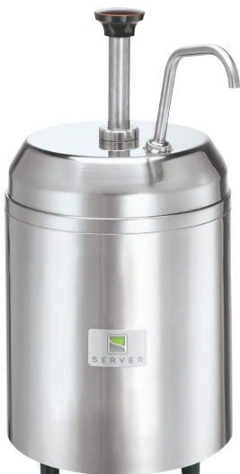
CSM 94000 (NOT NSF LISTED)