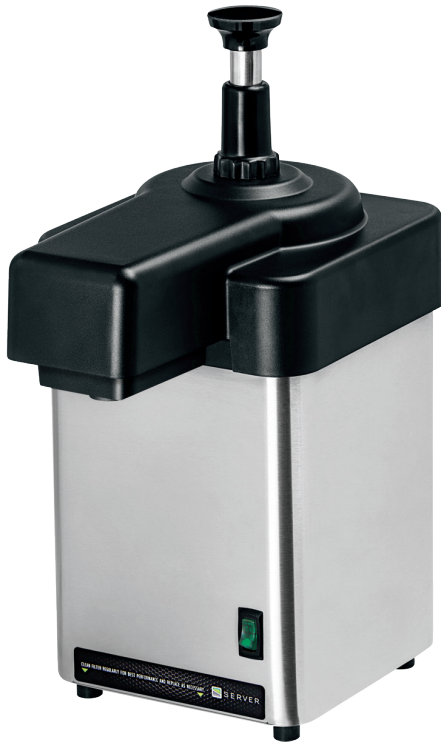
EZ-CREAM™ CSP 94160 \frac{5}{16} oz (9.2 mL)