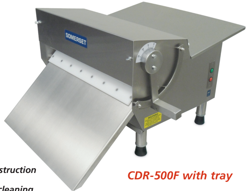
CDR-500F with tray