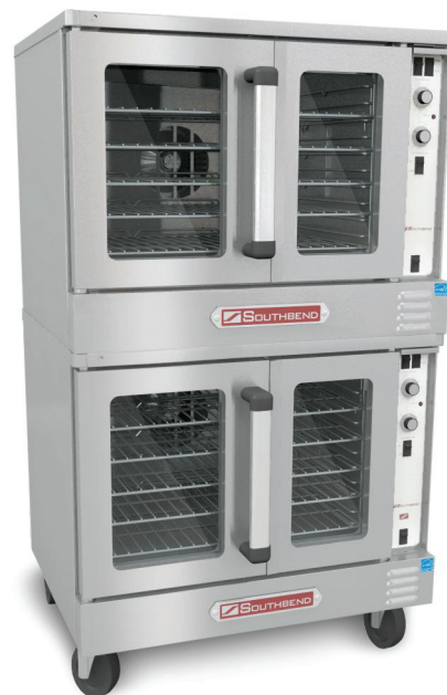
(shown with optional casters)