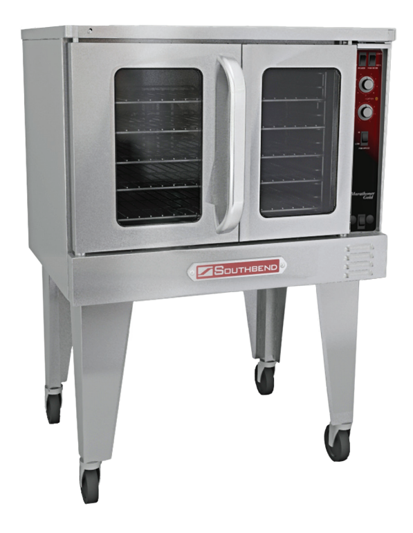
(ES/10SC shown with optional casters)